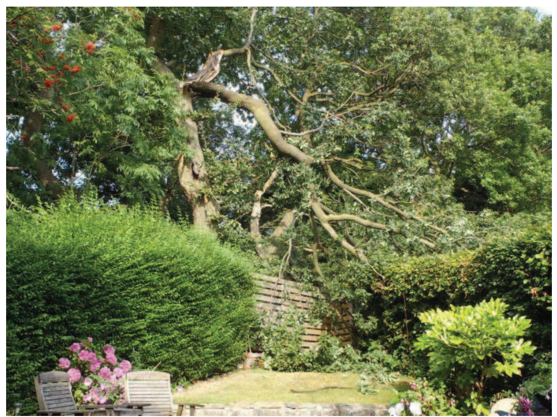
Photograph showing the garden of 23 Longford Road and the collapsed branch.

On Thursday I was contacted, in my role as sub contractor to Sheffield's Rights of Way section (PROW) to go and deal with a tree on a bridleway in Bradway that had shed a branch. This branch was only partially detached from the tree but was hanging in 2 adjoining gardens, somewhat to the consternation of the property owners. And I have to say justifiably so: